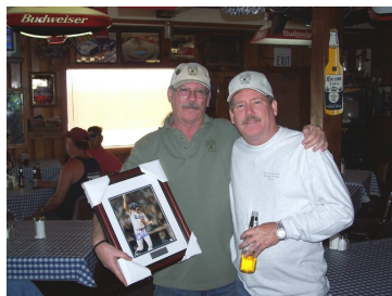
One of the many touching moments on the Fishin Mission—Walkbucks and HFTB .....