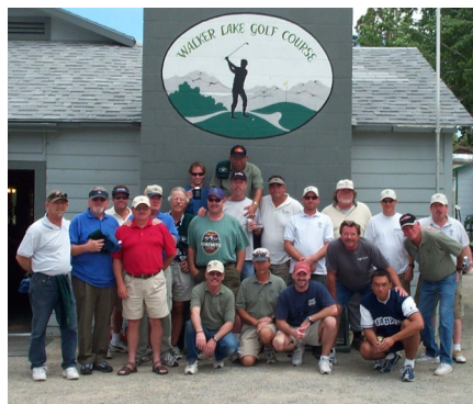
None the worse for weather—time for a group photo after the 7th Annual Rhino's WIDE OPEN!!