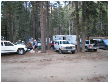
The crew starts gathering around 42D getting ready for a partee.....!

It's been 20 years and the record still holds! This was NOT the year someone broke this long standing record!