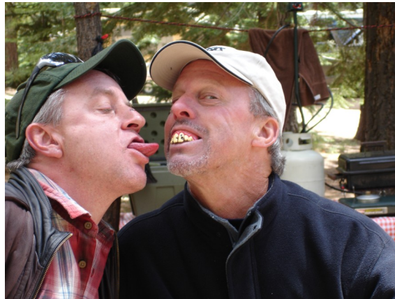
We did not take a group picture this year for some reason—so the editor elected this photo as "representative" of the 11 Annual Rhino's "Wide Open".....ewwwwww!

After 18 grueling holes—it was a tie at even par between the DUI's and the