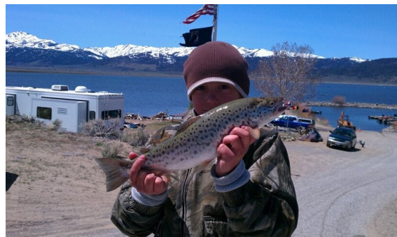
Random Facebook posting of youngster at the Marina!