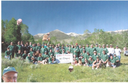
A great picture of the Fish-O-Rama team during their annual Father's Day Week trek!

It's important to remind all you Fishin' Missionaries that, regardless of your personal financial commitment, you should all be proud to be part of the group that created the Fishin' Mission Foundation! (FMF)